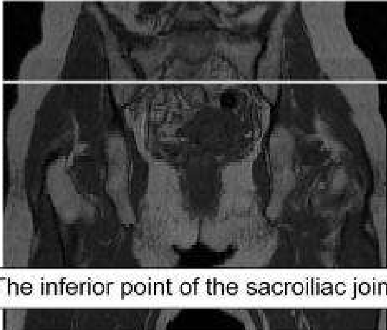
The inferior point of the sacroiliac joint